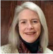
ESSA and Washington