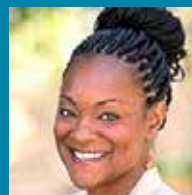
Elisha Smith Arrillaga Education Trust West California