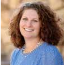
California's DASS Program