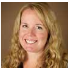
California's DASS Program